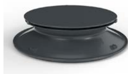
Patented Hyperbolic Insert