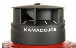
Control Tower Top Vent