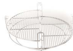
Divide & Conquer® System