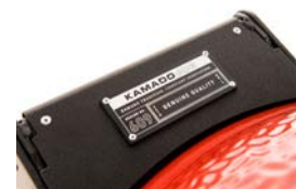
Air Lift Hinge