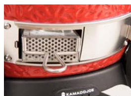
Patented Ash Collector