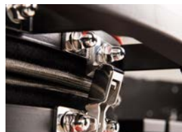
Stainless Steel Latch