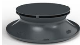
Patented Hyperbolic Insert