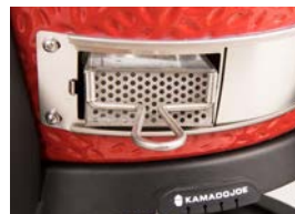
Patented Ash Collector