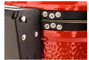
Air Lift Hinge