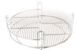
Divide & Conquer® System