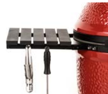
Aluminum Side Shelves