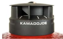
Kontrol Tower Top Vent