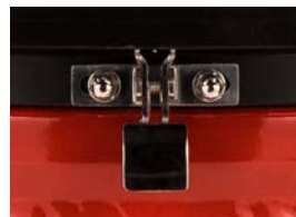
Stainless Steel Latch